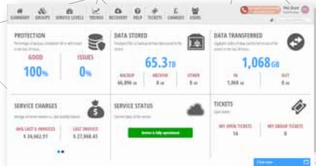
Fig. 2 Consumer Portal